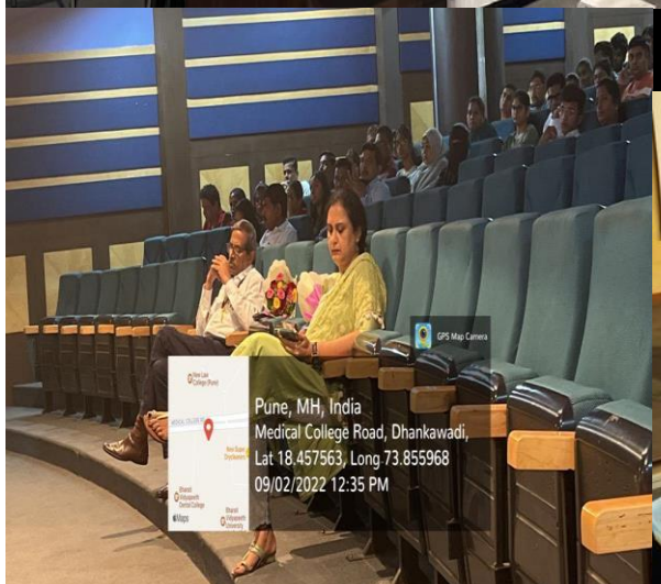
Pune, MH, India Medical College Road, Dhankawadi, Lat 18.457563, Long 73.855968 09/02/2022 12:35 PM