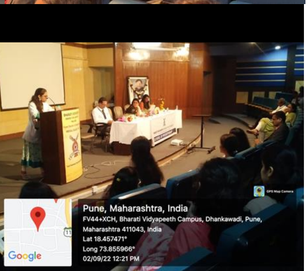
Pune, Maharashtra, India FV44+XCH, Bharati Vidyapeeth Campus, Dhankawadi, Pune, Maharashtra 411043, India Lat 18.457471° Long 73.855966° 02/09/22 12:21 PM