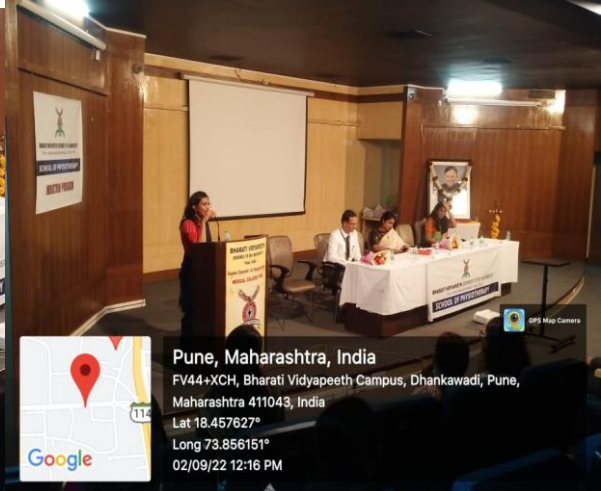
Pune, Maharashtra, India FV44+XCH, Bharati Vidyapeeth Campus, Dhankawadi, Pune, Maharashtra 411043, India Lat 18.457627° Long 73.856151° 02/09/22 12:16 PM