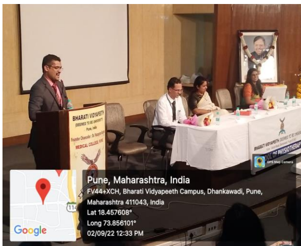
Pune, Maharashtra, India FV44+XCH, Bharati Vidyapeeth Campus, Dhankawadi, Pune, Maharashtra 411043, India Lat 18.457608° Long 73.856101° 02/09/22 12:33 PM