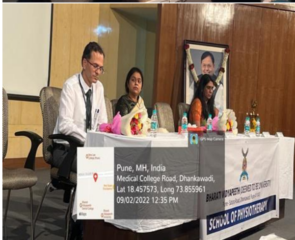
Pune, MH, India Medical College Road, Dhankawadi, Lat 18.457573, Long 73.855961 09/02/2022 12:35 PM